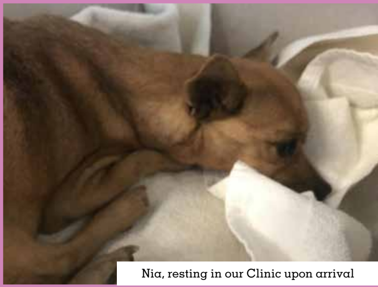
Nia, resting in our Clinic upon arrival

Last December a stray 1-year-old Chihuahua mix came to Animal Humane after a caring person found her lying motionless in the street.