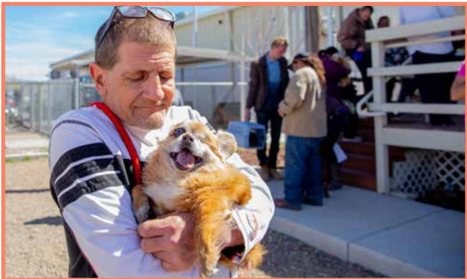
"She's the love of my life," Valencia Pet Health Fair client

By offering initially free (now $5/pet) vaccination & microchipping services on Sunday mornings in parks, schools & recreation centers, pet owners began to view our shelter as a partner in keeping their companions healthy and in their homes.